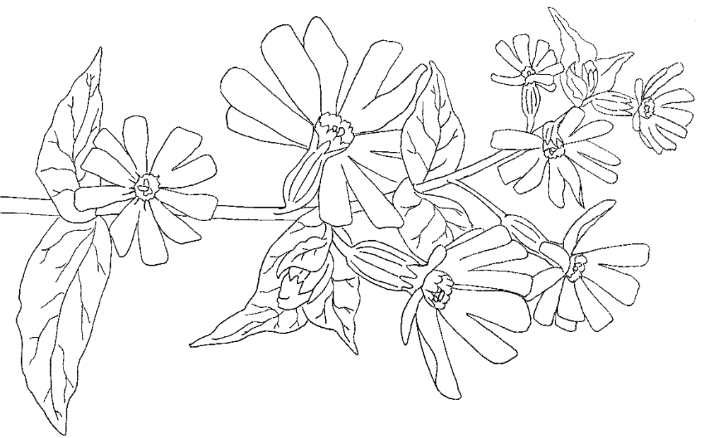
4 Red Campion