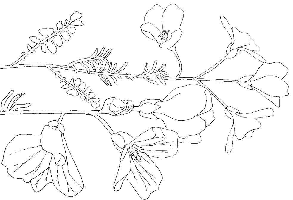
1 cuckoo flower