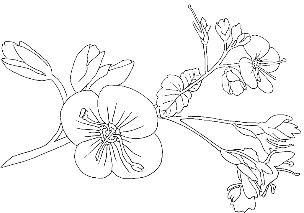
3 German Speedwell